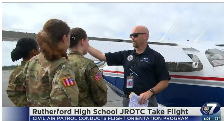
Rutherford High School JROTC Take Flight CIVIL AIR PATROL CONDUCTS FLIGHT ORIENTATION PROGRAM

This huge increase in orientation flight operational tempo has only been possible due to the direction and support of the Group DCC and DO, who organized a scheduling program enabling maximum utilization of aircraft and pilot availability. As a result, Group One has exceeded flight hours of all other FLWG groups COMBINED during the same time period.